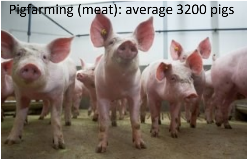
Pigfarming (meat): average 3200 pigs