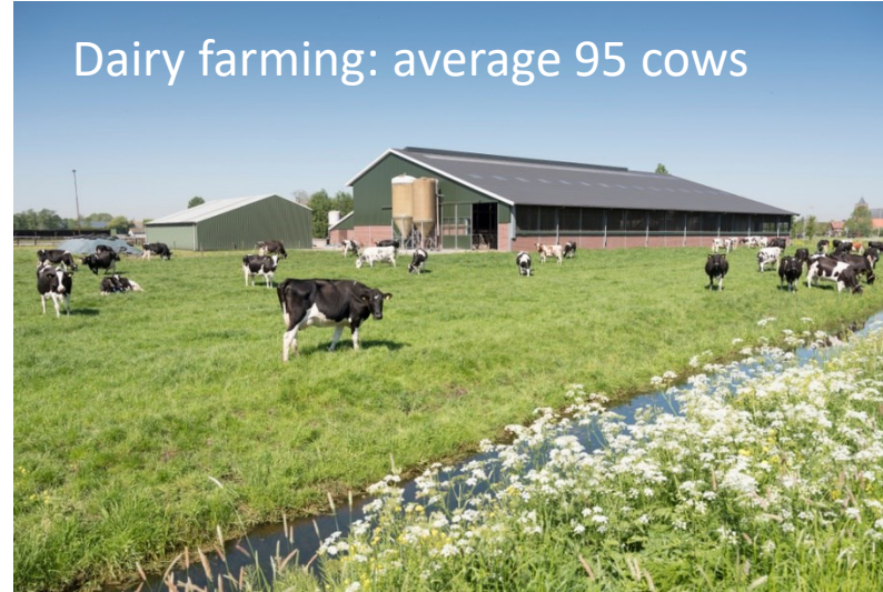
Dairy farming: average 95 cows